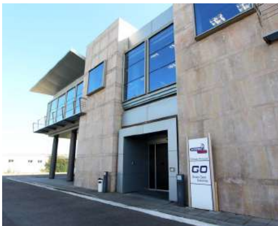
Entrance to the offices of the new premises.