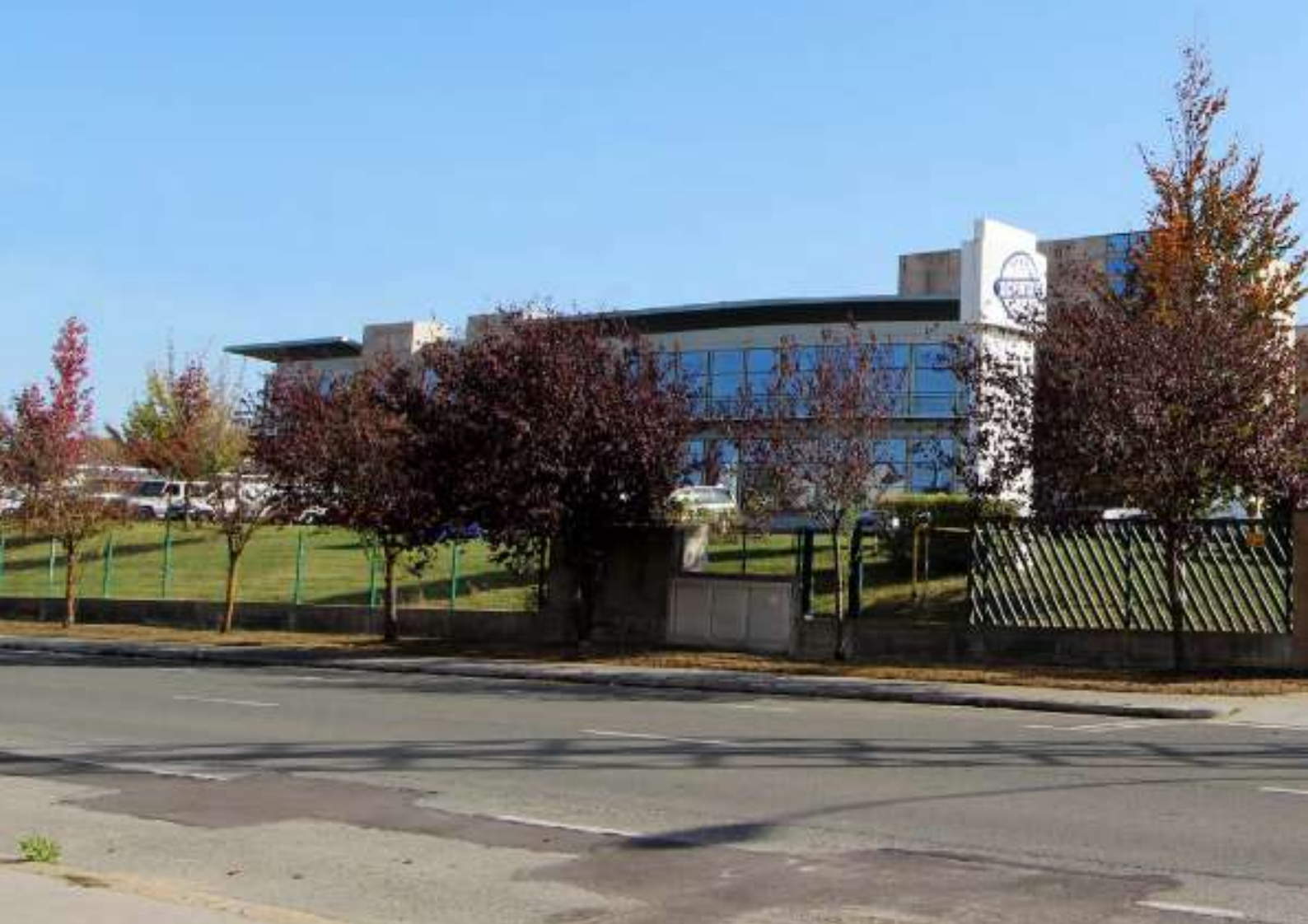
Photo from the outside of Xcentric Ripper International / Grade Cero Sistemas new premises.