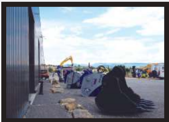
"Xcentric" products on the outside of the new pavilion.