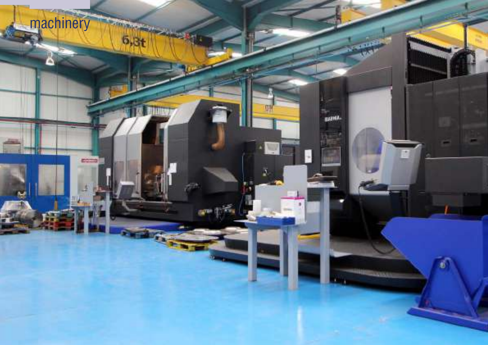
New machining centers Ibarmia brand.