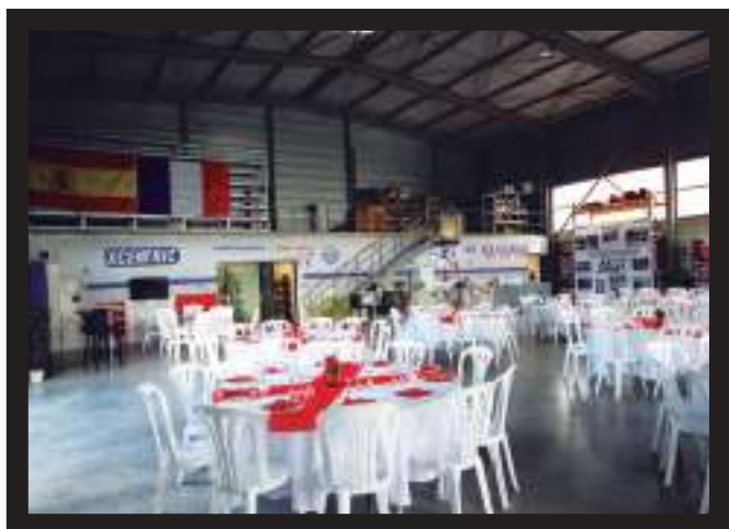
Inside the pavilion prepared for the opening dinner.