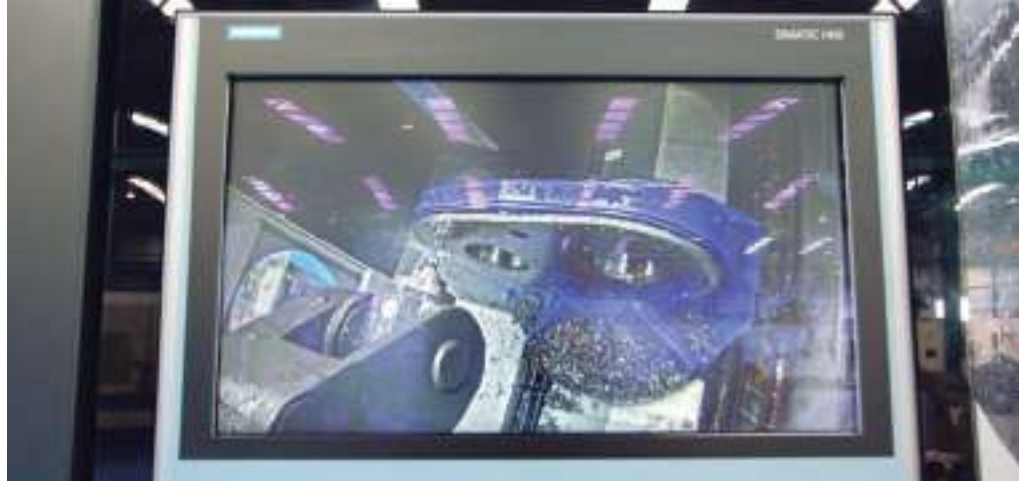
Screen for the machining process control, in the THC16 Multi process model.