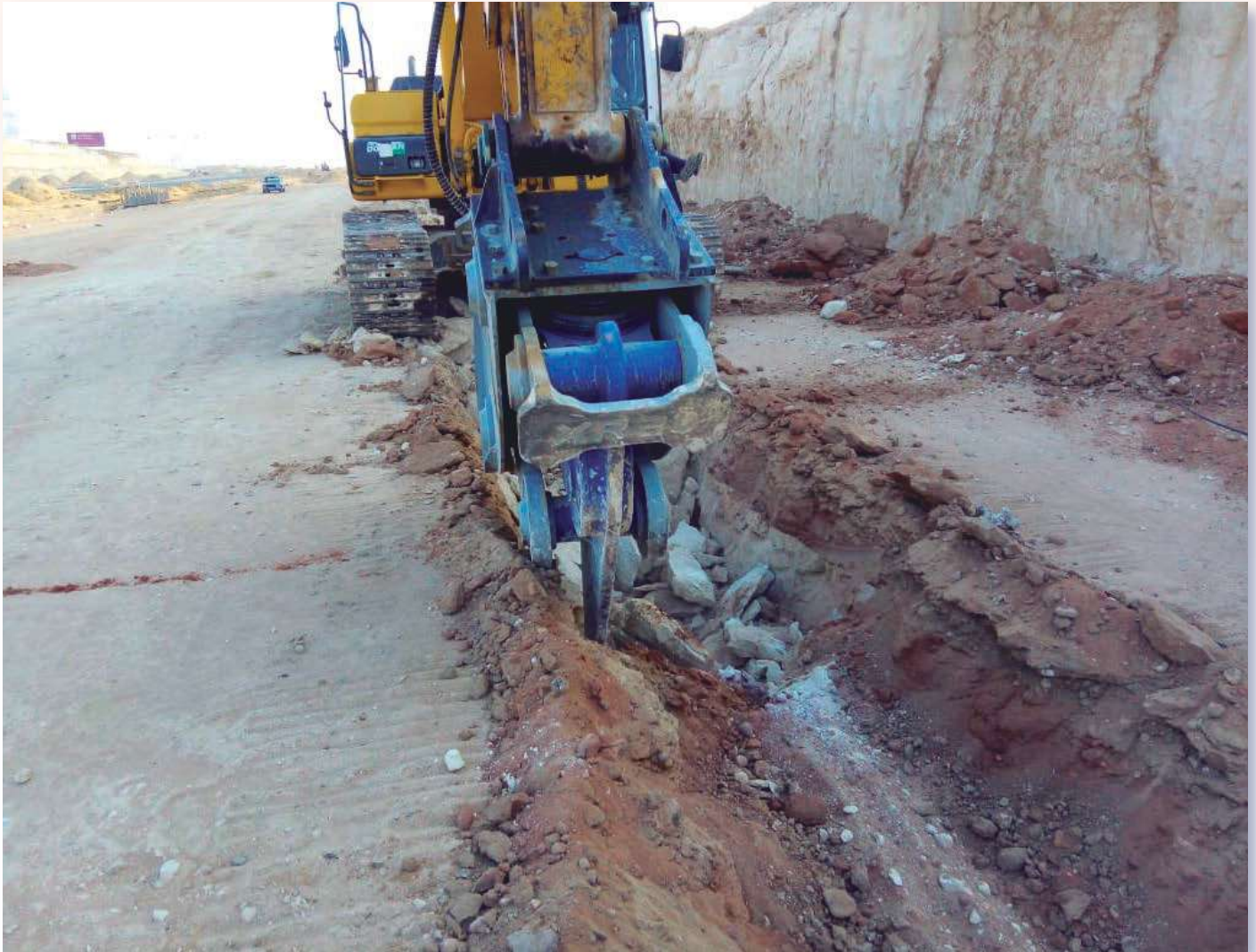
Xcentric Ripper XR20 working in a trench project in Egypt.

Dealer of the Xcentric products in Egypt