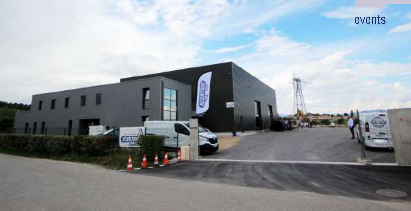
Outside of the new facilities of Xcentric Ripper France.