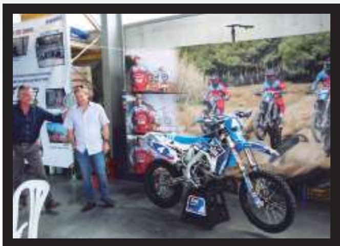
One of the motorcycles of the team "TM Racing Xcentric - France", sponsored by our distributor.