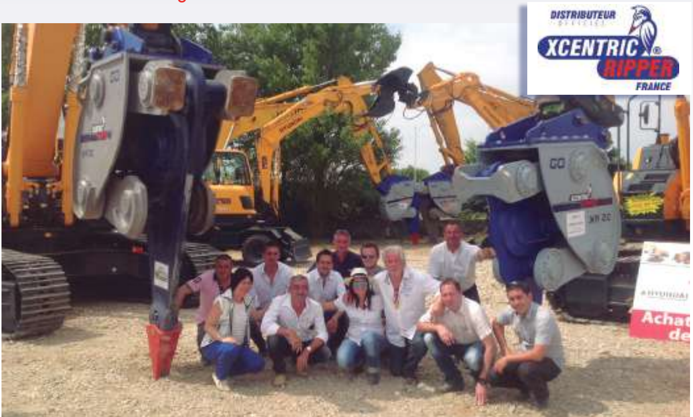
Team picture with resellers