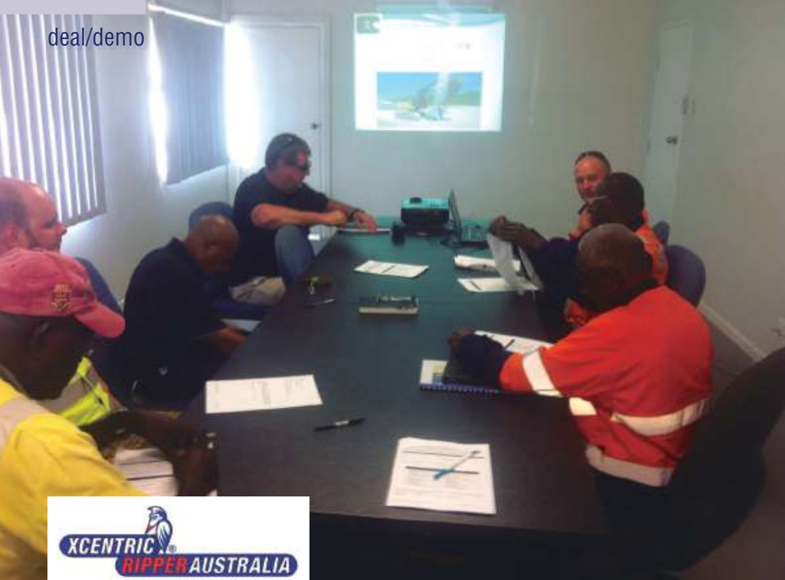
Training for the XR40 doing a Power Point presentation, going thru the start-up instructions, how to use the Ripper and servicing the XR40 & intervals.