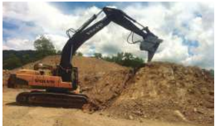
First XR40 delivered and start-up done. Satisfied customer, Curtain Bros are interested in more rippers.