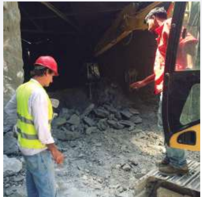
XR10 on the CAT Excavator working at the local Cement factory breaking up Clinker in a shed and outside.

Regretfully, with the Global slump of Oil and Gas prices, which the Trinidad & Tobago economy is based on, the local economy is in such a mess with customers facing yards filled with equipment as the projects diminish with the reducing oil price, preferring to rent and or use their old equipment instead of investing in new equipment. We are optimistic that this cycle will turn and we will return to more modest rates of growth as the Global oil and gas prices rise again and confidence is restored in the market.