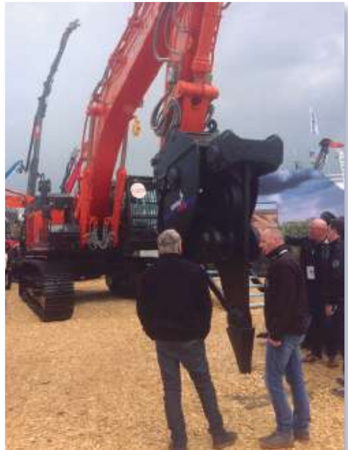
The XR in the Hitachi exhibition area painted in neutral color.