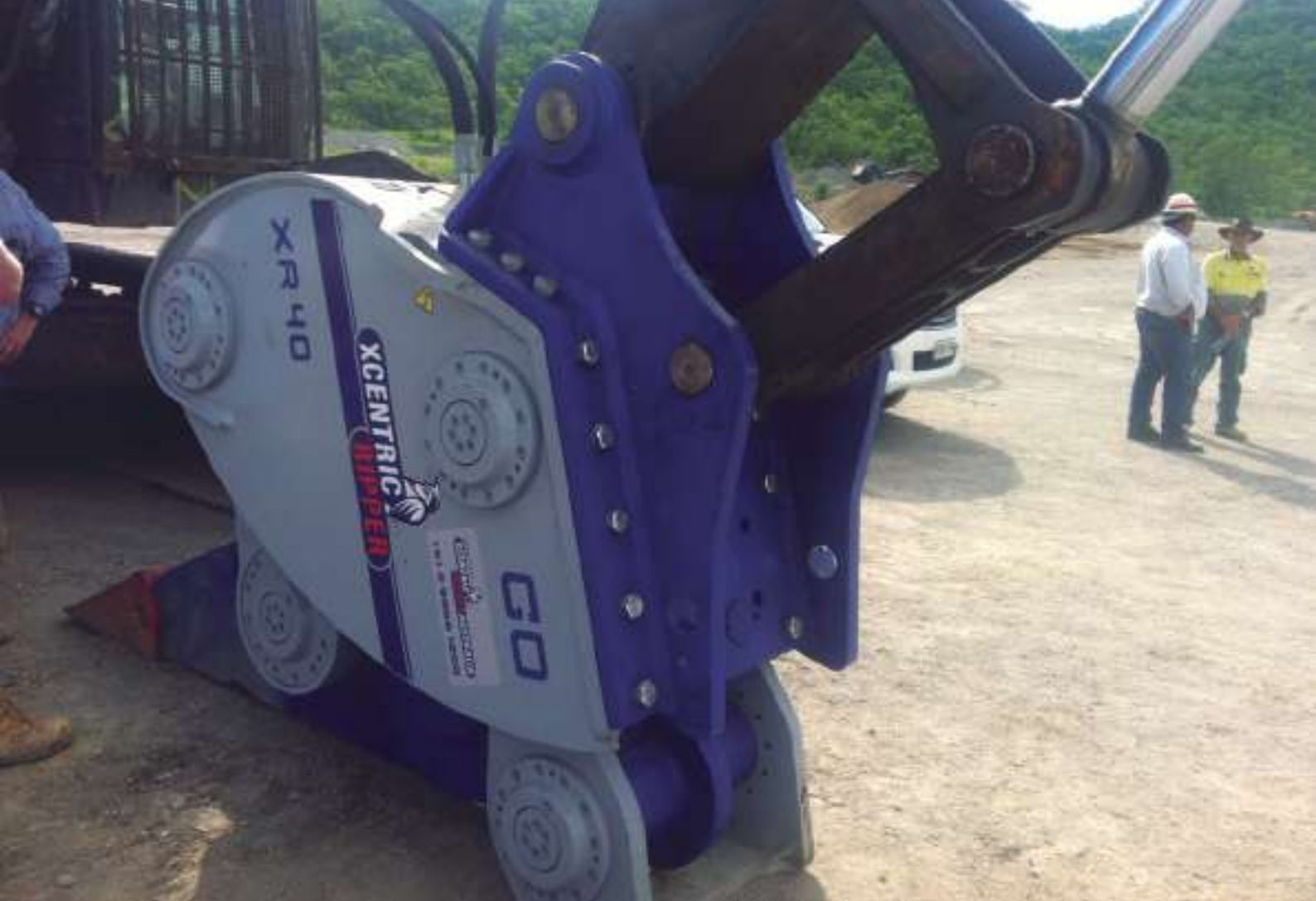
XR40 attached to the Volvo in Papua New Guinea, on Motukea Island.