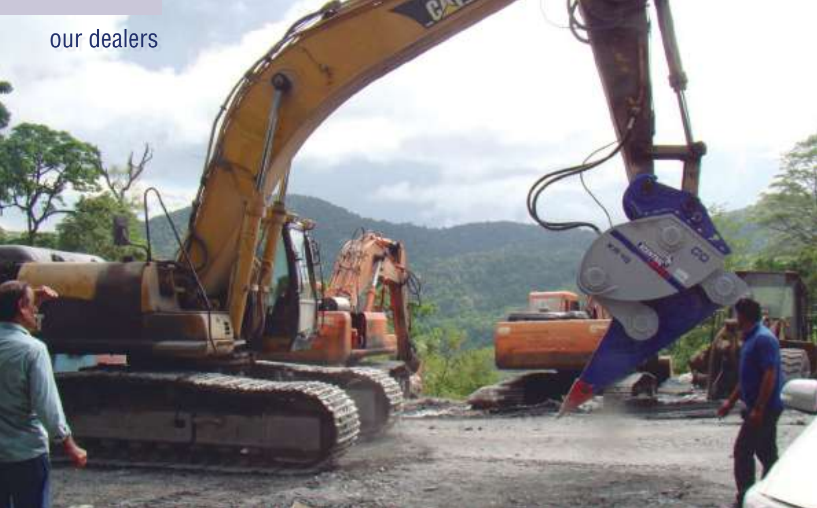
Xcentric Ripper XR40 working in Trinidad & Tobago.

In 2012, we decided that we wanted to expand out of the Material Handling business and get into Mining operations. In