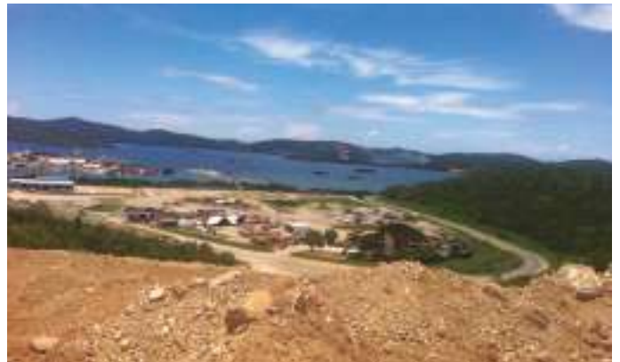
View from excavation site looking back at Motukea Island where new International dock is being built for Port Moresby.