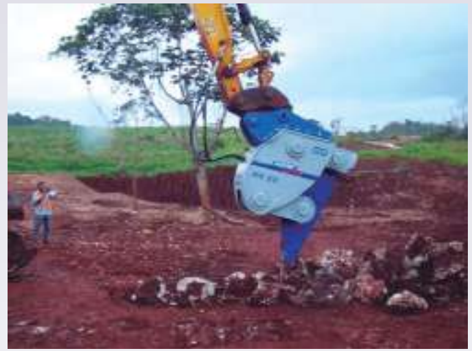
XR20 in Jamaica, a place with a lot of opportunities for us.