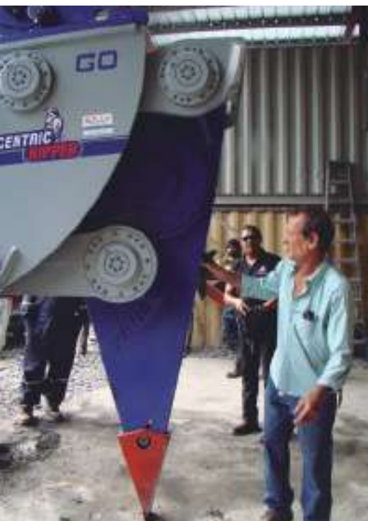
Xcentric Ripper XR40 working in Trinidad & Tobago.