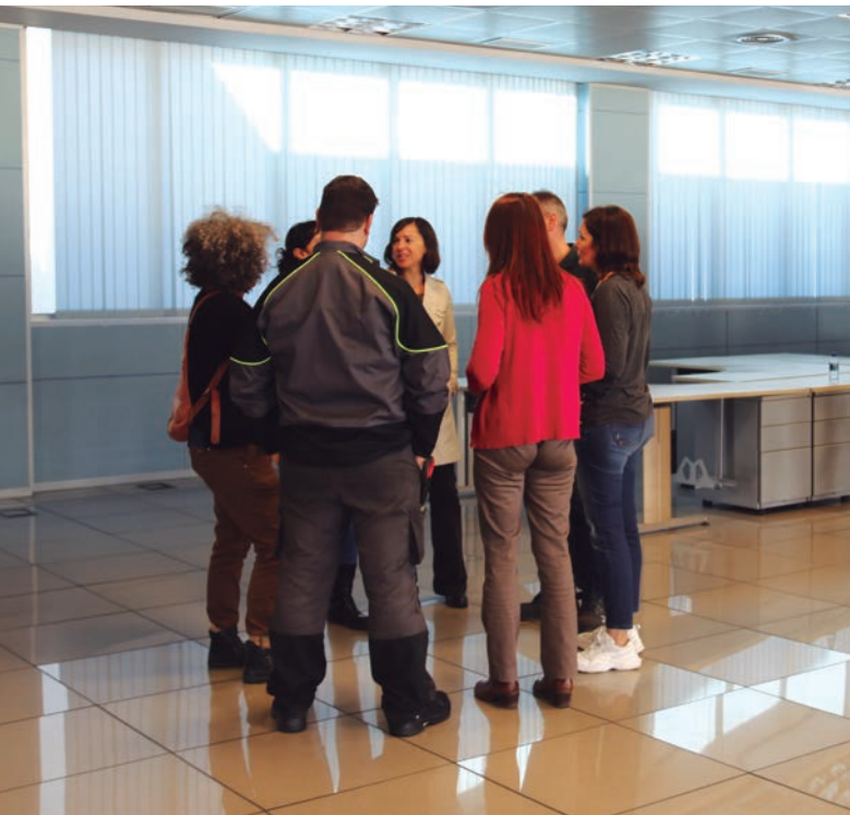
Our colleagues chatting with the teachers after the visit.