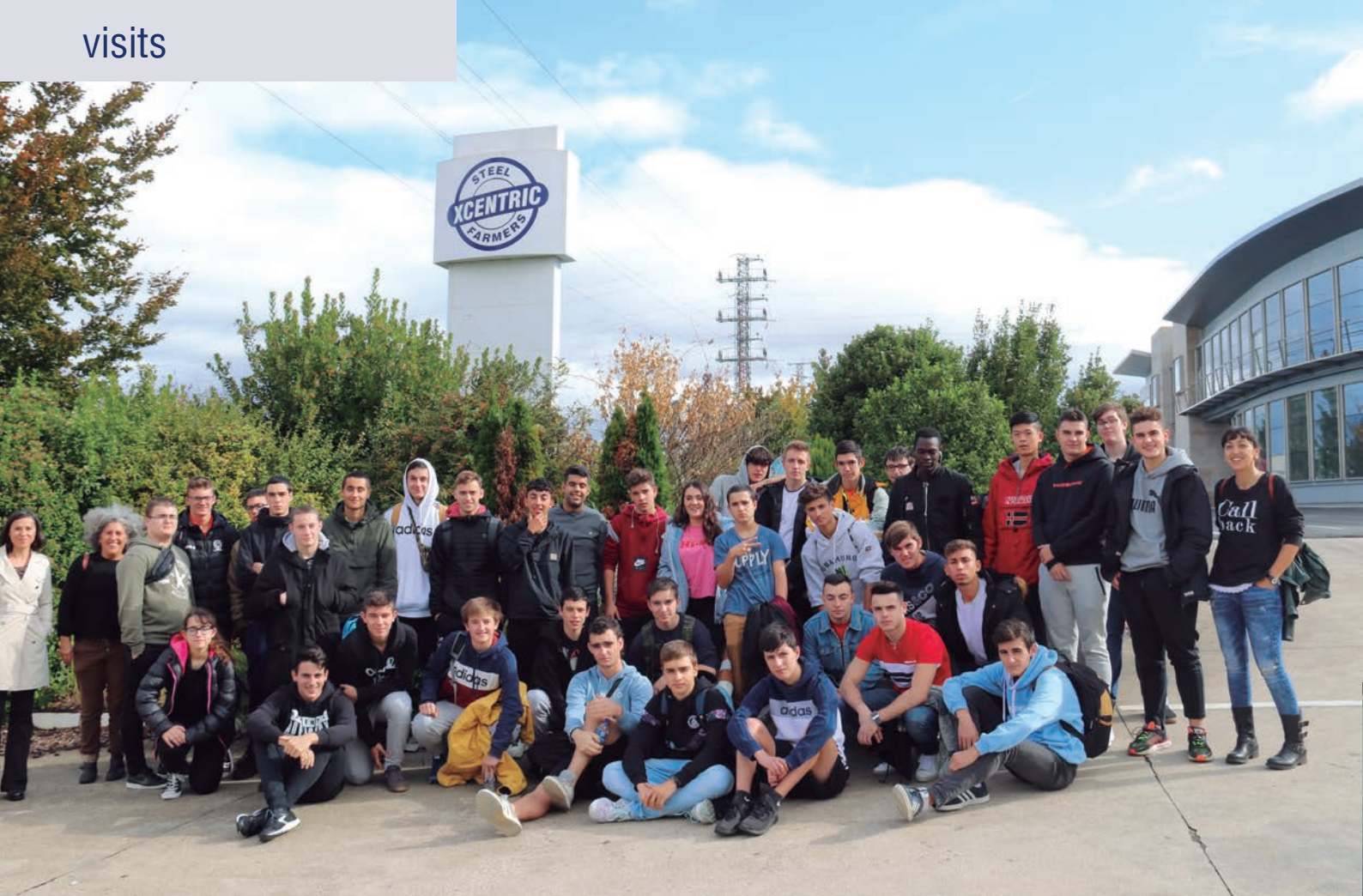
Students and teachers of the Formative Cycle who visited us in October.