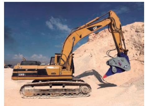
XCENTRIC RIPPER XR42 Lebanon