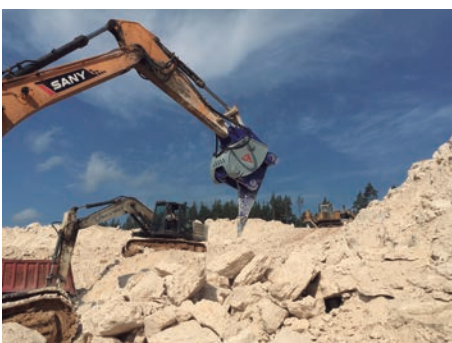
XCENTRIC RIPPER XR40 Nizhny Novgorod region (Russia)