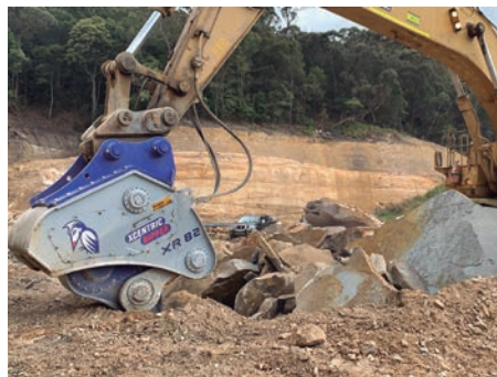
XCENTRIC RIPPER XR82 Sydney (Australia)