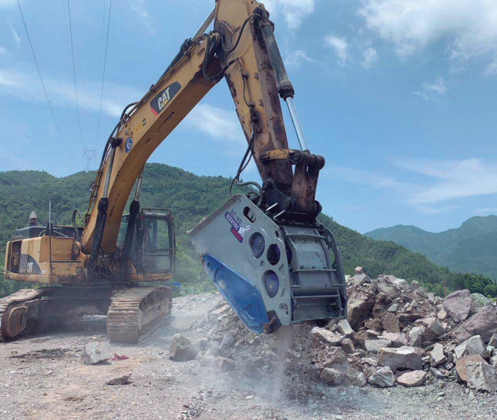
Xcentric Crusher XC40 working in China.