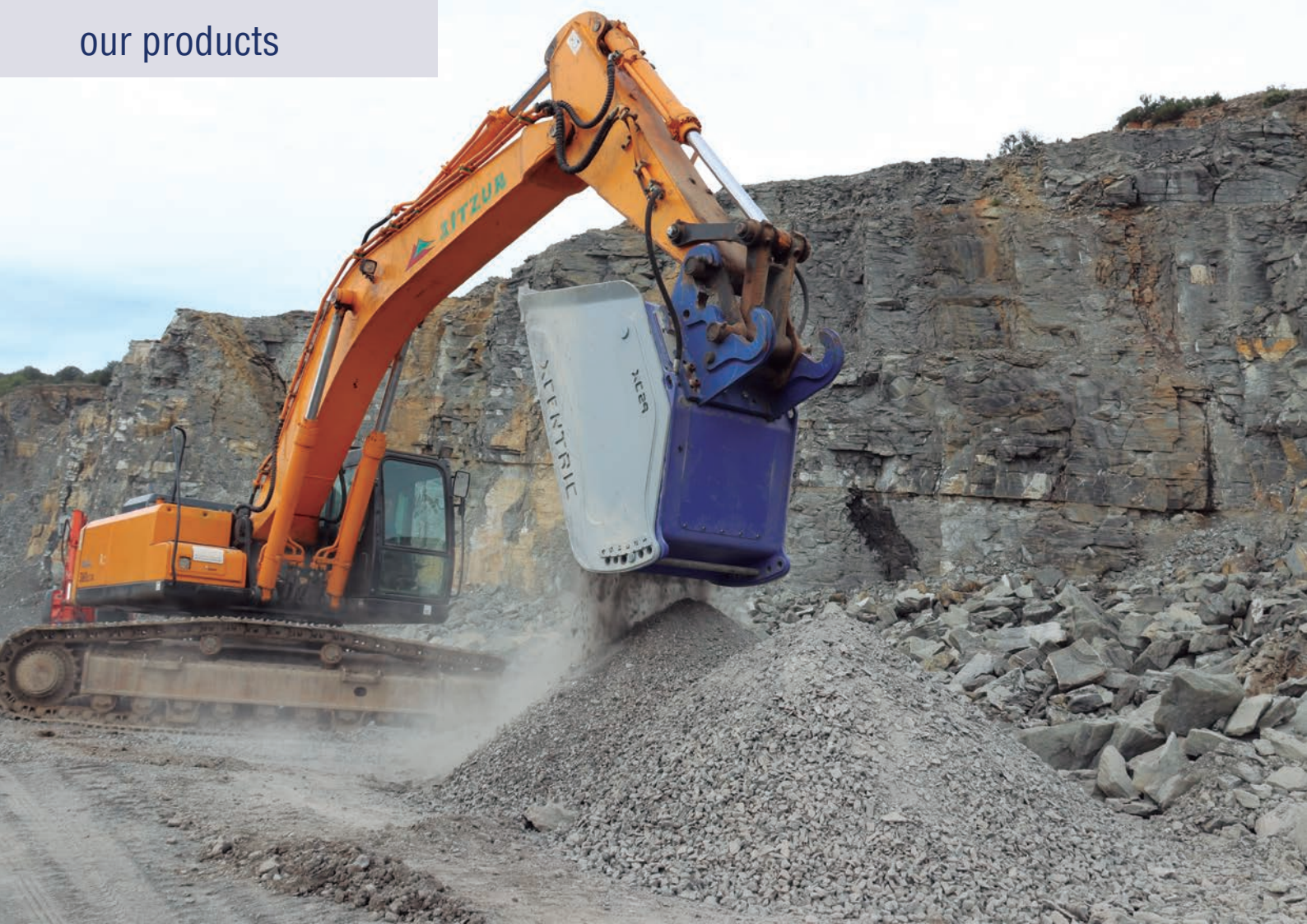
Xcentric Crusher XC29, the last model of the 'A' Series that is already in the market.