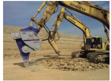
XCENTRIC RIPPER XR50 Estonia