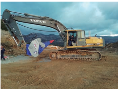
XCENTRIC RIPPER XR42 Naxos Island (Greece)