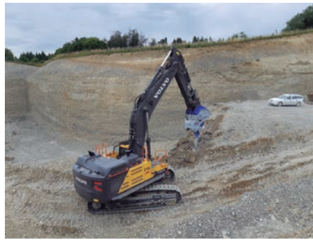
XCENTRIC RIPPER XR82 Messerli Kieswerk, Oberwangen, Bern, (Switzerland)