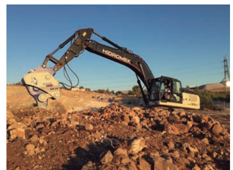
XCENTRIC RIPPER XR32 Bergama - Izmir (Turkey)