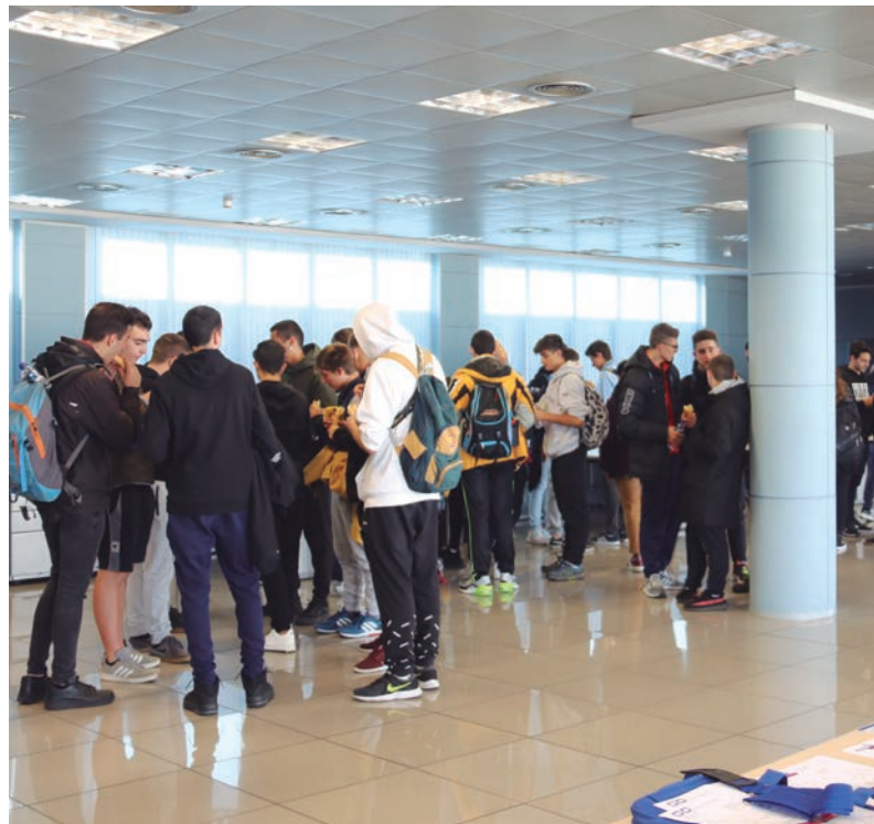
Appetizer after touring our workshop.

“The visit was a pleasure, and our assessment is very positive”