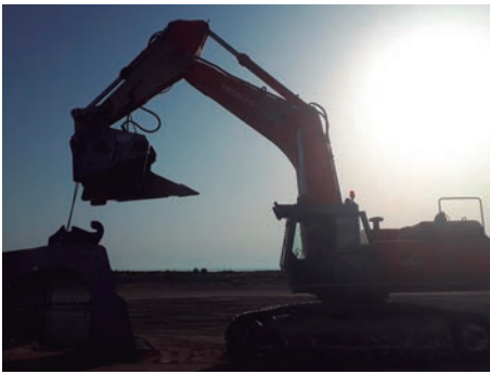
XCENTRIC RIPPER XR60 Yesos Alabastrinos quarry (Spain)

These are some of the best photos our customers and dealers took of our products during the last year 2019