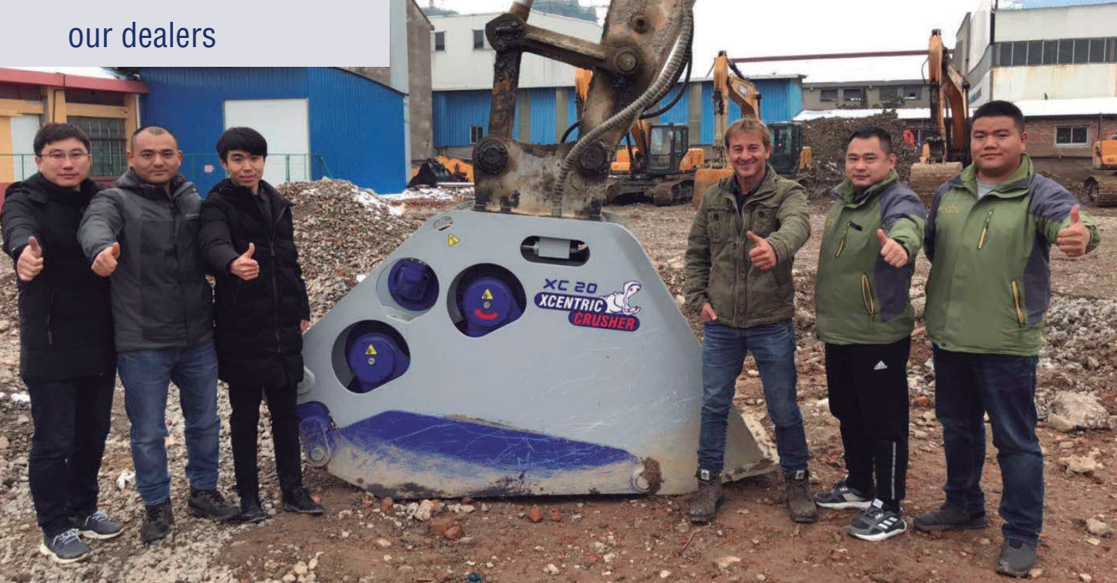
A demo made with a Xcentric Crusher XC20.