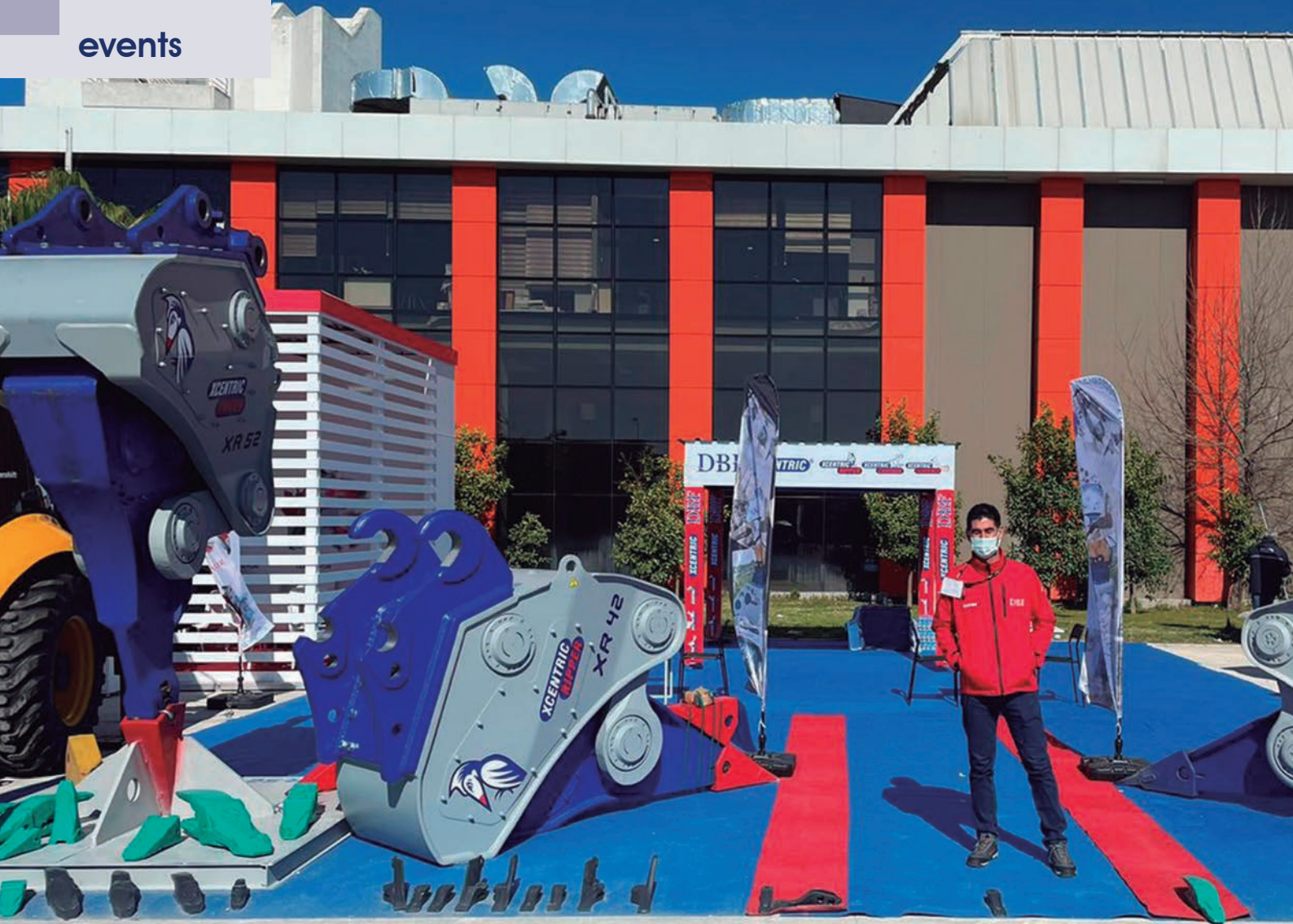
Stand of DBF Limited, Xcentric distributor in Turkey, during the KOMATEK 2022 fair.