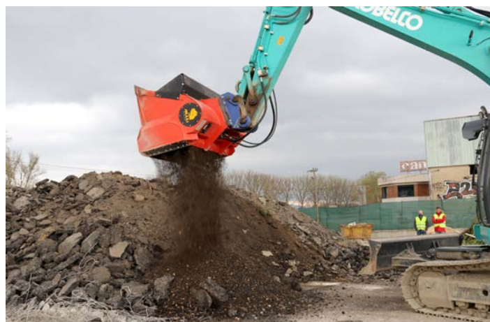
Demonstration of the ALLU Transformer with other materials.

have spent years researching and developing new implements that, in addition to their usual applications, provide the customer with the ability to recycle the materials generated, in addition to reducing fuel consumption, transportation costs, etc.