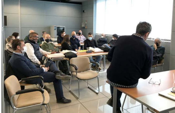
Start of the day, with presentation, explanation of the product and round of questions to solve doubts.