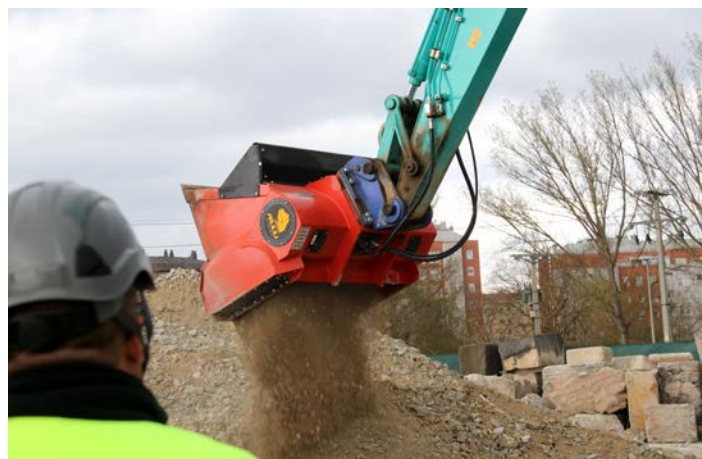
ALLU Transformer demo at a recycling plant.