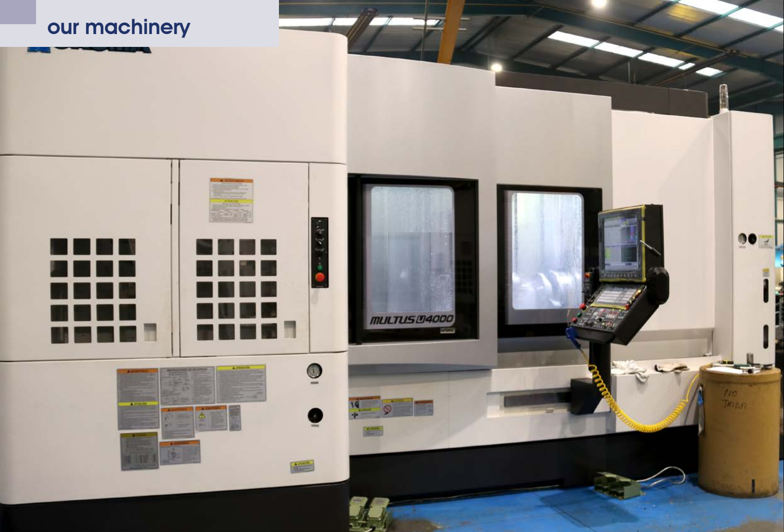
Second multitasking lathe of the Okuma brand, model MULTUS U400, recently incorporated in the machining workshop.