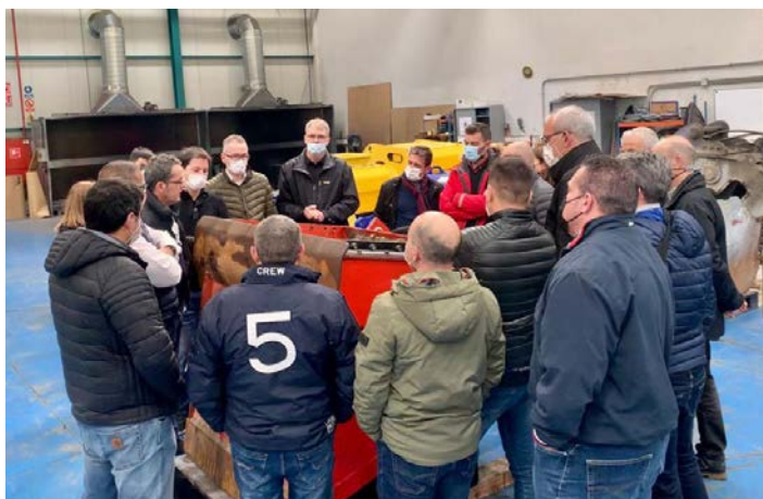
Technical training about installation and maintenance at the Grado Cero workshop.