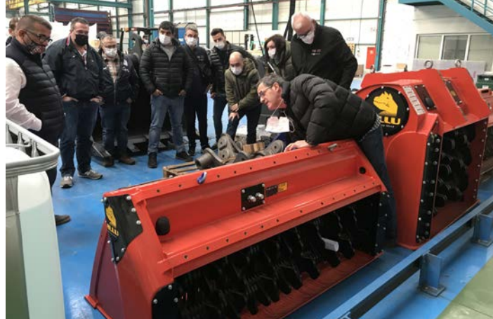
Physical inspection of the screening buckets in the workshop.