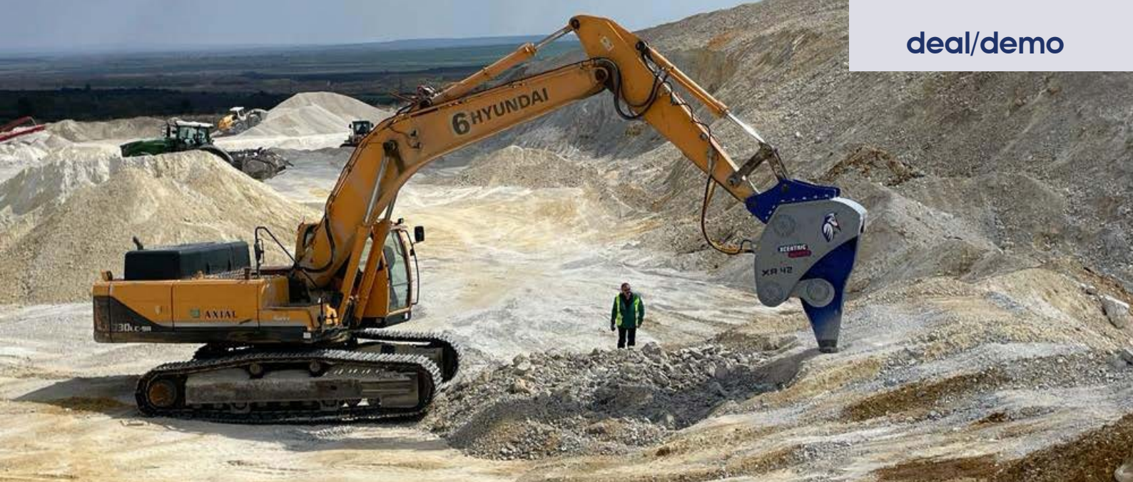
Commissioning of an Xcentric Ripper XR42 in Hungary last April.