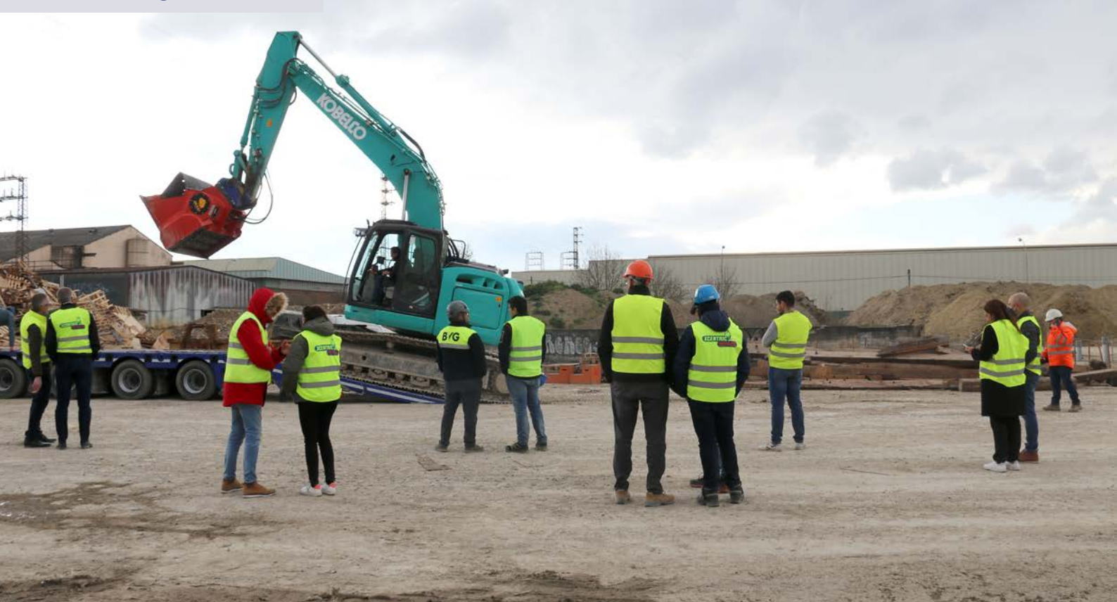
Dealers from Spain during the demonstration with the ALLU Transformer at a recycling plant in Vitoria-Gasteiz.