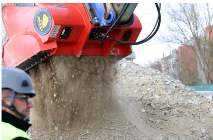
Proof of the great productivity of this implement.