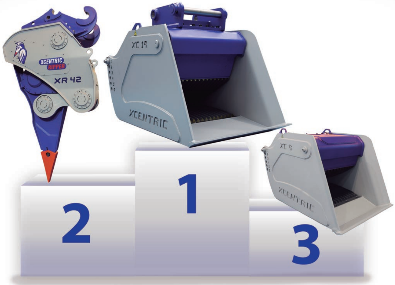
The best selling 3 Xcentric attachments during 2022: Xcentric Crusher XC19, Xcentric Ripper XR42 and Xcentric Crusher XC9.