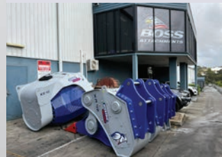
XR42, XR22, XS40... Australia